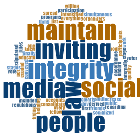
Figure 2. WordCloud Of Interview Results

Based on the picture above, the Pekanbaru City Umum Election Commission, in increasing community participation, maintains its integrity so that every time it carries out its activities or work, the KPU can work smoothly according to the regulations that have been established.